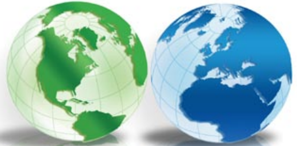
ENERGY EFFICIENT REFRIGERATION PLATFORM

...two times more energy efficient than machines made five years ago.